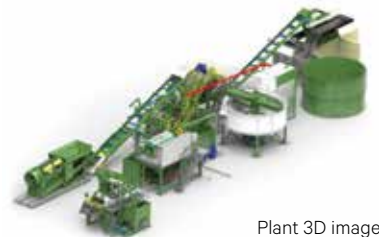
Plant 3D image

This project was supported by the Environmental Trust as part of the NSW EPA's Waste Less, Recycle More initiative, funded from the waste levy.